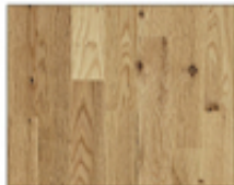
RED OAK MONTE CARLO