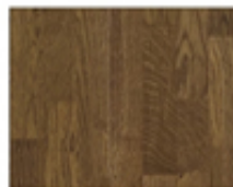
OAK SAN ANTONIO