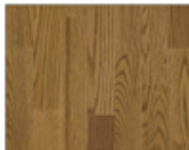
RED OAK NEW YORK